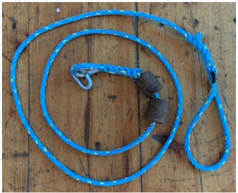
Figure 8. 10-foot mark leash with two inline weights.