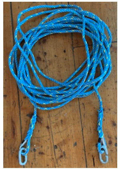
Figure 6. 40-foot blue anchor line.