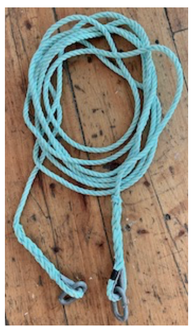
Figure 7. 20-foot green anchor line.