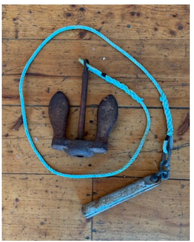
Figure 4. Anchor with 10-foot leash and an anchor leash weight.