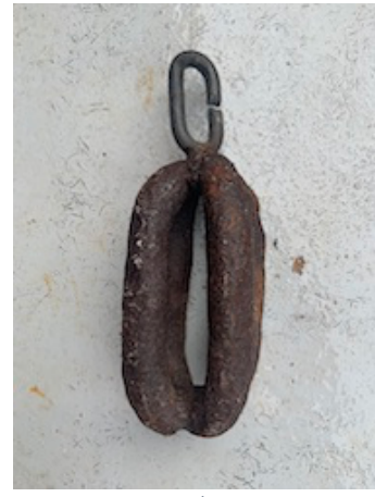
Figure 5. Pin weight.